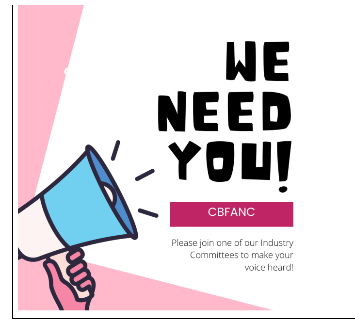
CBFANC Newsletter - July 2024 - Info Expeditor